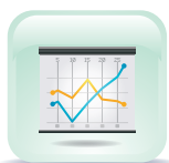
Very low operative noise figure