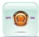
ON/OFF switch for +24 VDC passing