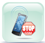
GSM frequency rejection filter