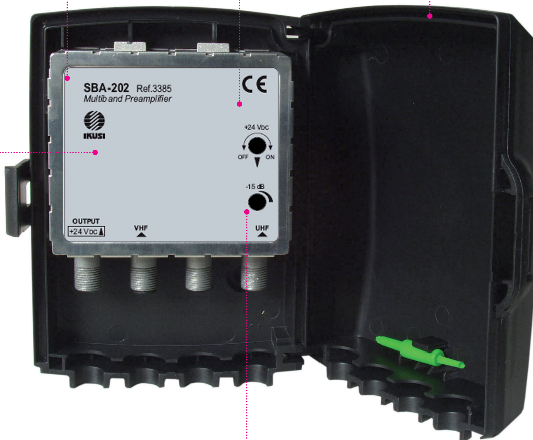
Interstage variable attenuator